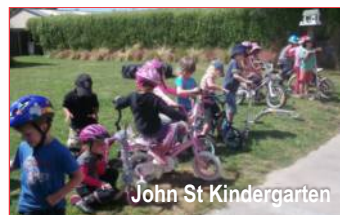
John St Kindergarten